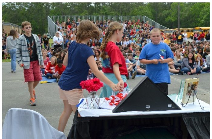
As the names of 132 Brunswick County residents who gave their lives in past wars were read, some of the 700 Shallotte Middle School students approached the Memorial Table and placed a VFW poppy to honor and remember them.