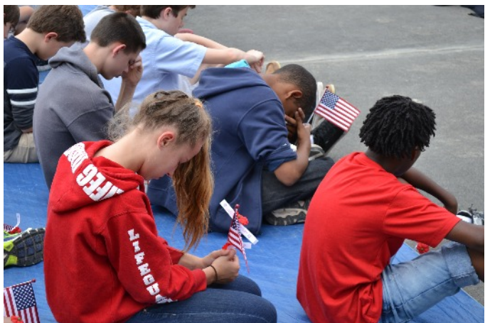
700 Students of Shallotte Middle School attended a May 22nd Memorial Day service outside the school. Each received a small American Flag and symbolic VFW Memorial Poppy with which to remember the day and its